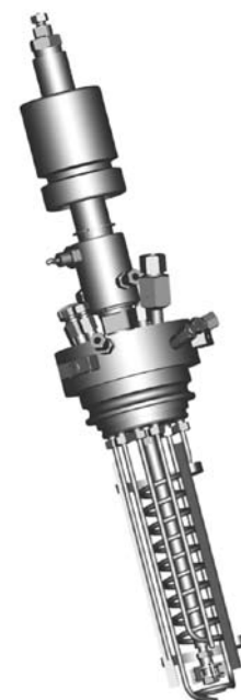
1,000 ml ZipperClave® Reactor Internals

** Overall height based on belt driven units. For actuals see standard drawings.